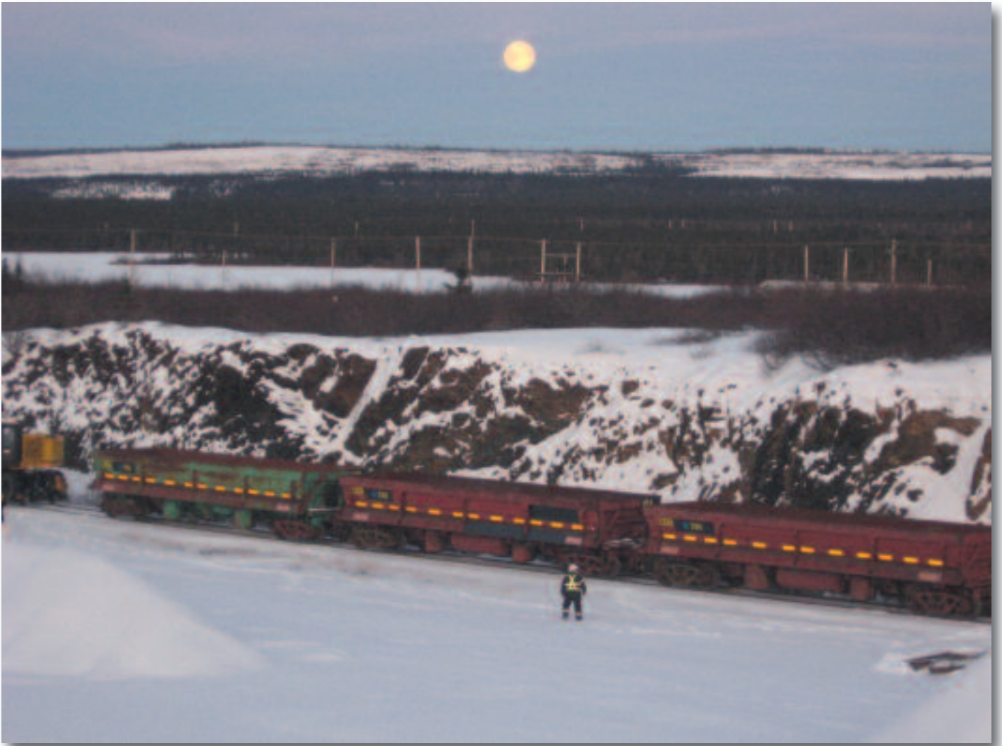
Labrador: Bulk sample iron ore en route to deep sea port at Sept-Îles