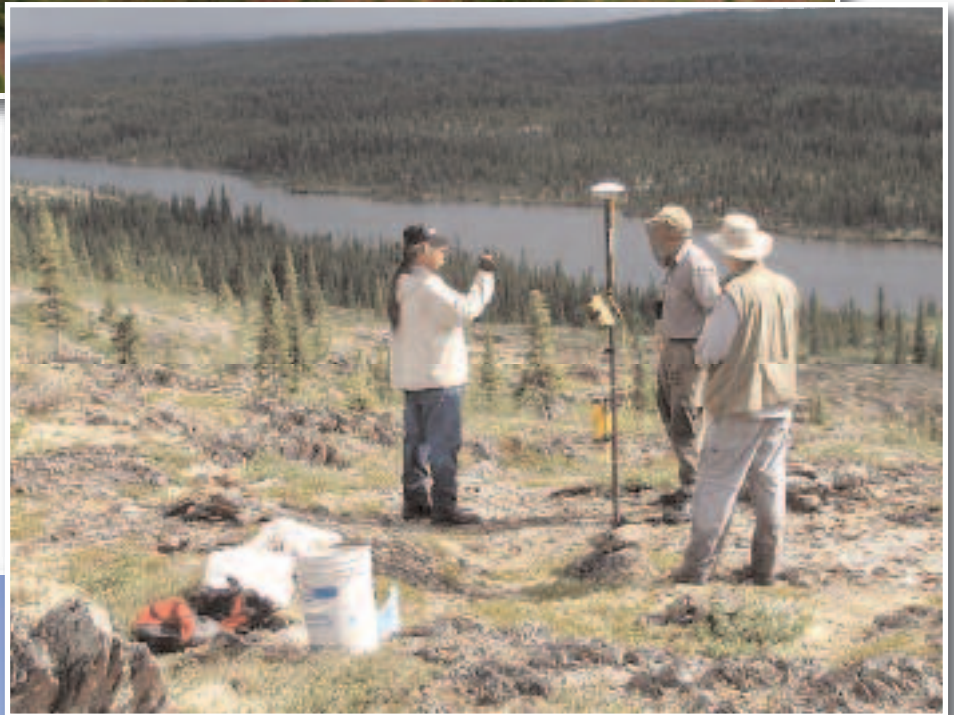
Labrador staff carrying out environmental work at the Houston deposit