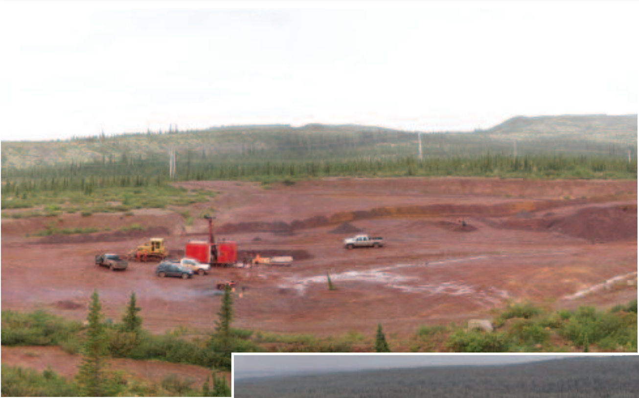
Drilling at the Redmond Deposit, one of the phase I areas scheduled for early production.