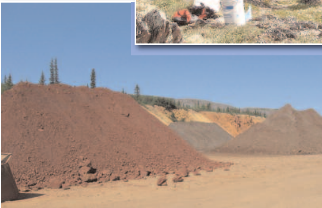
Bulk samples at Silveryards near Schefferville after crushing and screening.